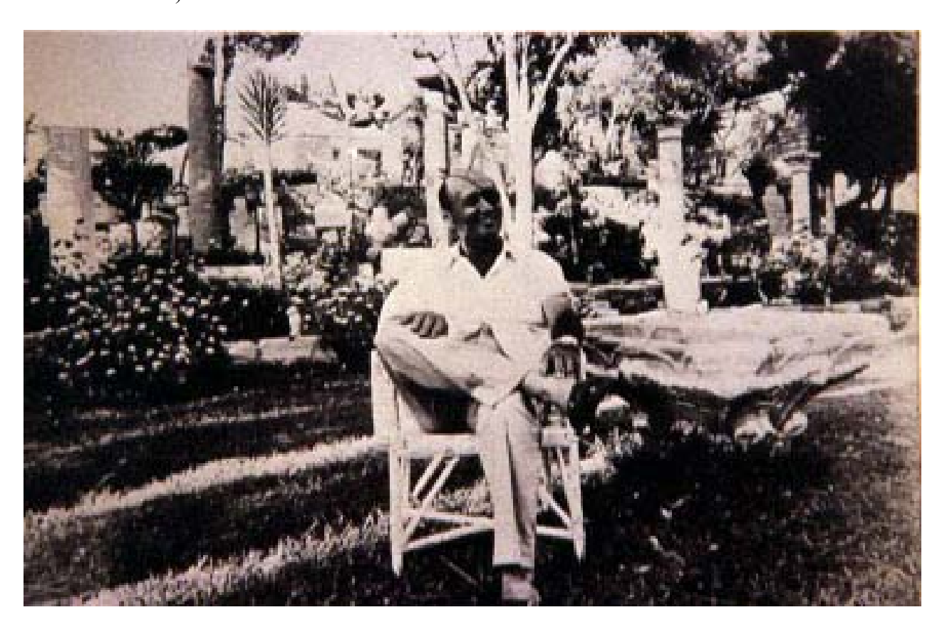
Dayan in his Zahala Garden of Antiquities.

Dayan turned his Zahala house into an archaeological garden (Dayan 1976:125; Ben-Ezer 1997: 122-3). At first, the collection was a source of joy, but it gradually became an obsession. Pictures of the garden were published, e.g., "In the family circle, on uniform and in a civilian [dress]"- Dayan holding an ancient bowl. Another photo states that "archaeology requires not only patience, but also wisdom-of-hands", showing Dayan restoring a clay jar (Yurman 1968). In fact, museum workers had to re-treat many objects, because Dayan's restorations were not good (Ornan 1986: introduction; M. Ben Gal, interview 2.9.01).